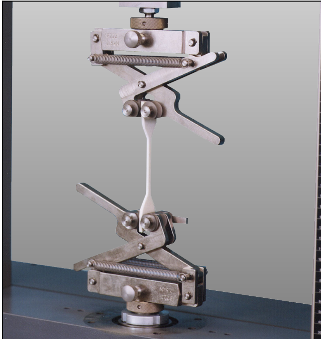
Pincer Grips, Type 8222, Fmax 2.5 kN